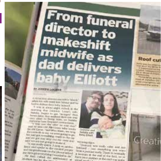
Dominic becomes a reluctant midwife Page 5