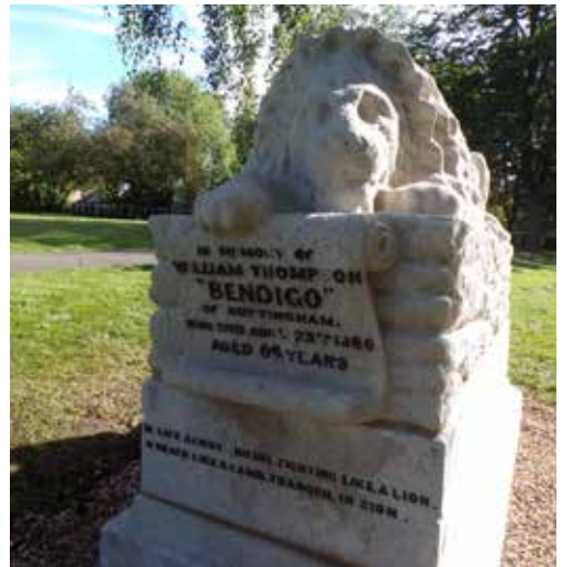
Bendigo memorial is cleaned Page 2